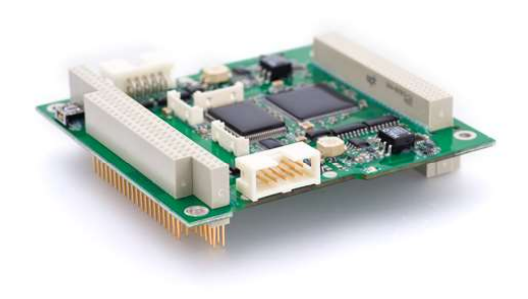
Kvaser PC104+ HS/HS IDC